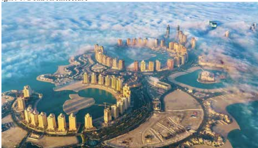
Figure 1: Doha Architecture