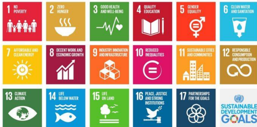
Figure 3: UN Sustainable Development Goals