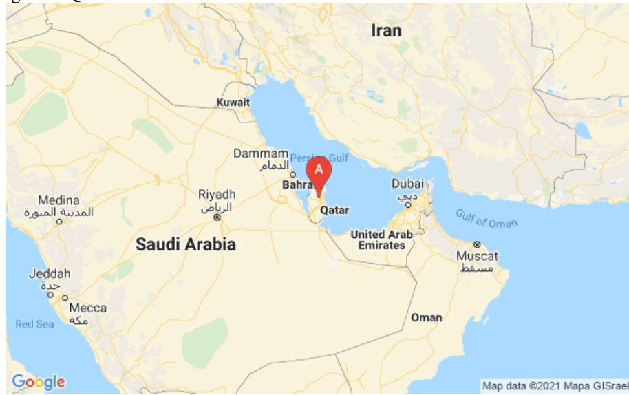
Figure 2: Qatar Geolocation