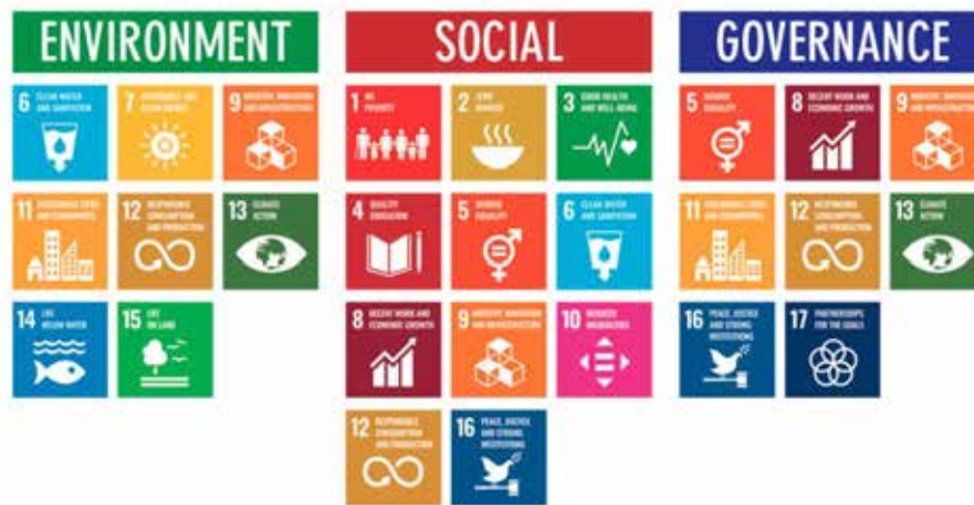
Figure 1: SDG through the lens of ESG